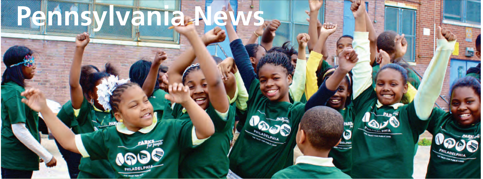
William Dick School students celebrate the launch of schoolyard greening in Philadelphia.