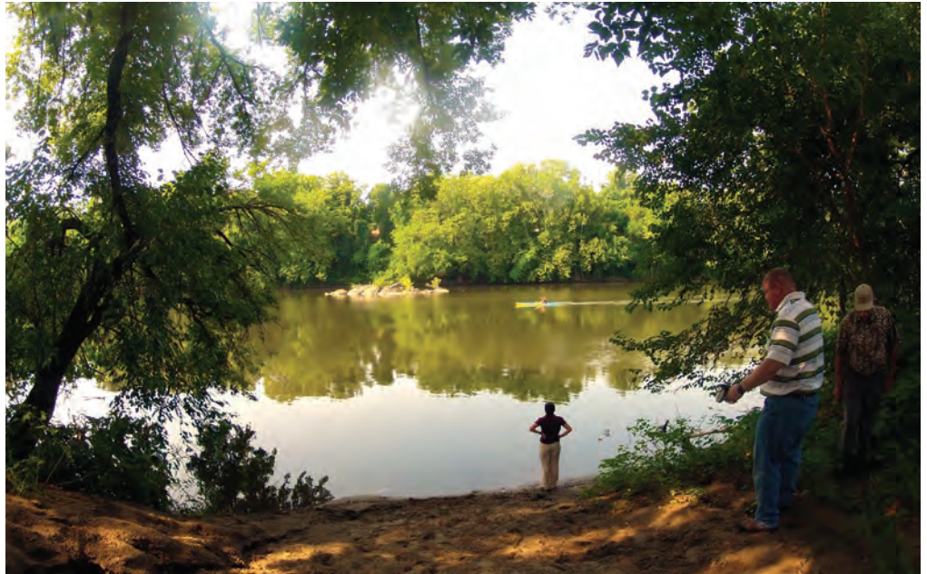
Members of the Schuylkill River Heritage Area, the PA Fish and Boat Commission, RTCA, and the Dragon Boat Association participate in a boat access site reconnaissance.

Facilitate public participation; guide improving landing and launch facilities; assist with strategic plan.