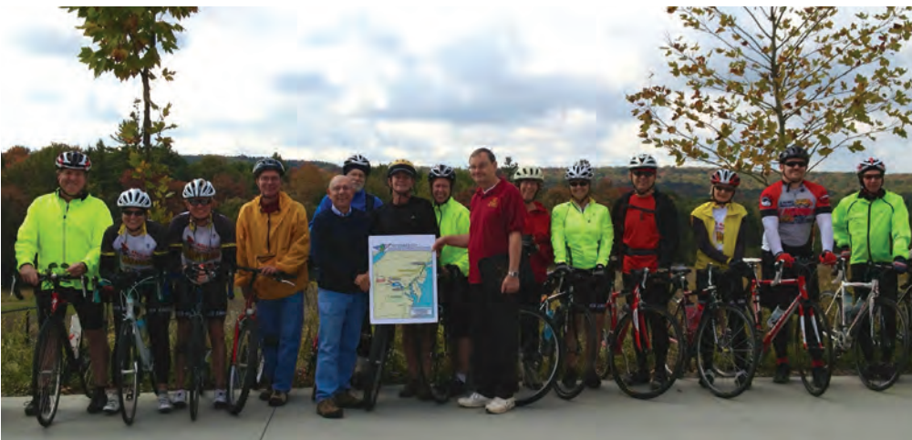
The first 9/11 Trail group bike ride, starting out at Flight 93 National Memorial, fall 2012.