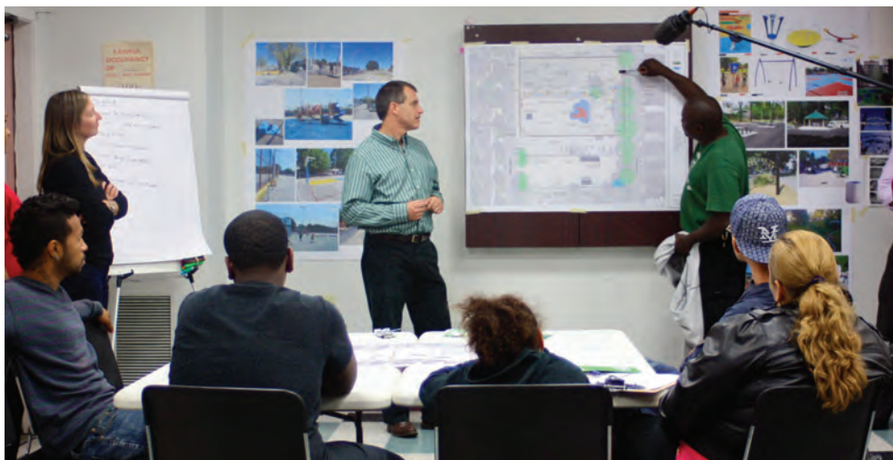
Wells Appell Architects and Trust for Public Land review the re-design of Collazo Park with the local community.

Assist with participatory design process and stewardship planning with students and community residents in schools and recreation centers.