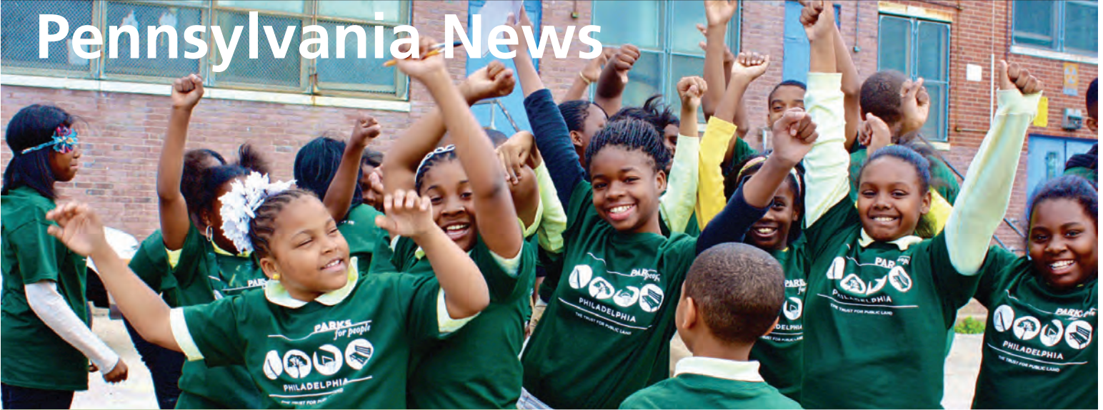
William Dick School students celebrate the launch of schoolyard greening in Philadelphia.