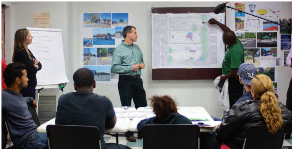
Wells Appell Architects and Trust for Public Land review the re-design of Collazo Park with the local community.

Assist with participatory design process and stewardship planning with students and community residents in schools and recreation centers.