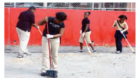
Students at William Dick School participate in a schoolyard clean-up day.