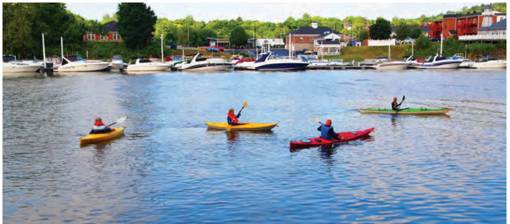
Beaver County Rowing Association holds a "Learn To Row" event on Beaver River in June 2012.

Establish a healthy community through social, economic, and environmental actions including trail development and restoration of Johnston's Run.