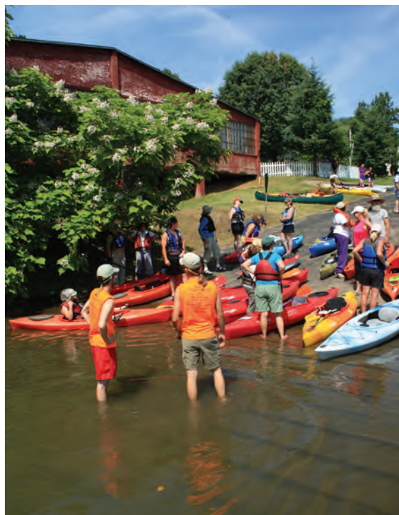
Student Conservation Association (SCA) staff help paddlers enter the Monongahela River at Rices Landing in summer 2012.