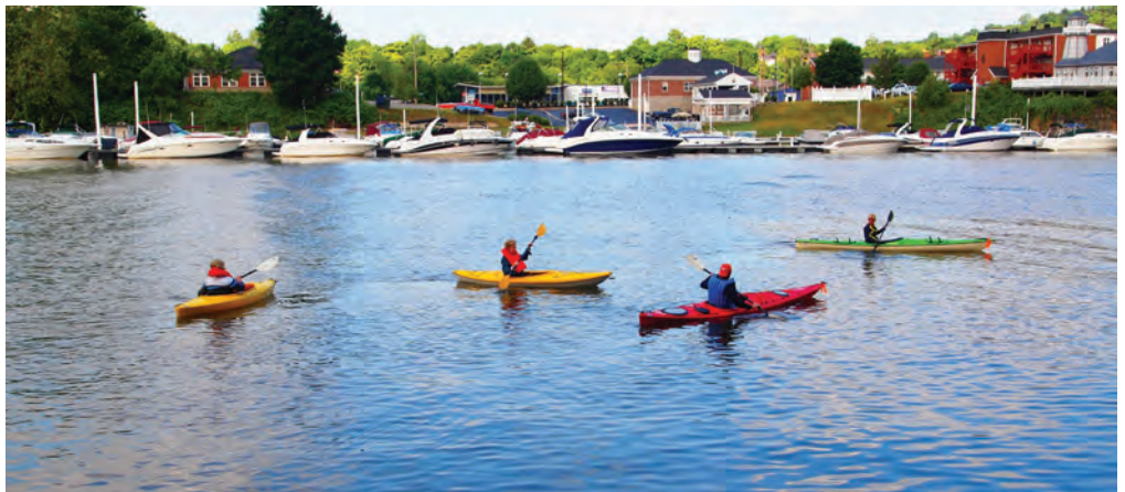
Beaver County Rowing Association holds a "Learn To Row" event on Beaver River in June 2012.

Establish a healthy community through social, economic, and environmental actions including trail development and restoration of Johnston's Run.