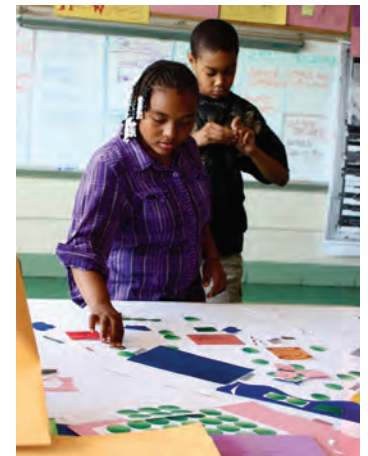
Students design their new schoolyard.